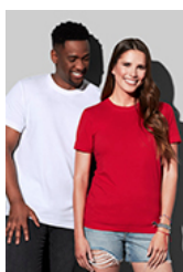
ST2020 Classic-T Organic