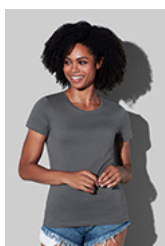
ST2620 Classic-T Organic