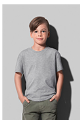
ST2220 Classic-T Organic