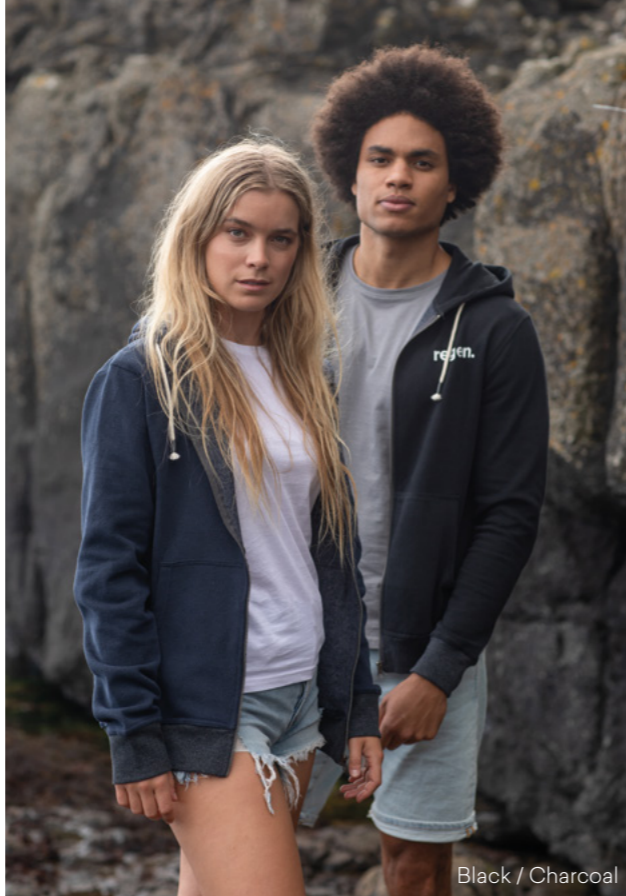
Black / Charcoal