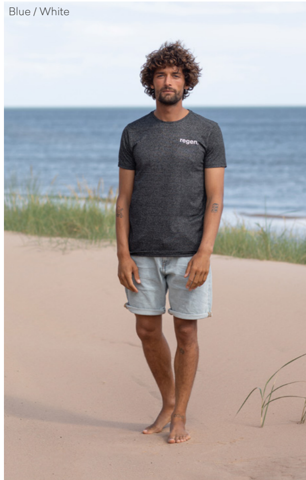
Blue / White