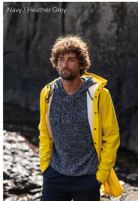
Navy / Heather Grey