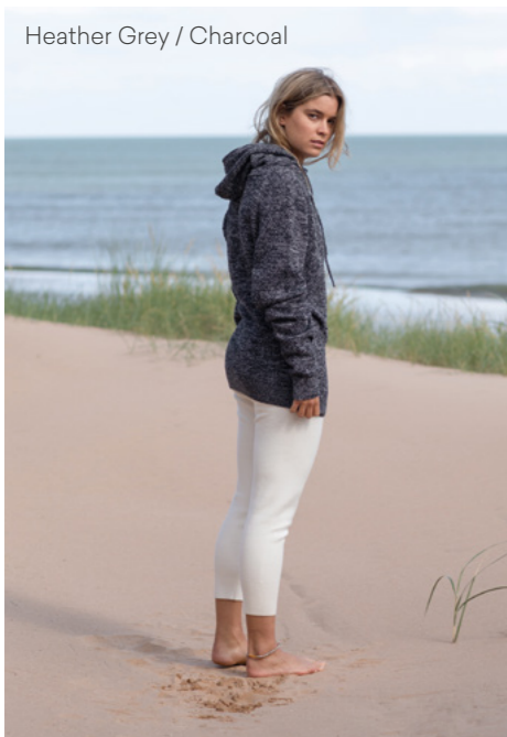
Heather Grey / Charcoal