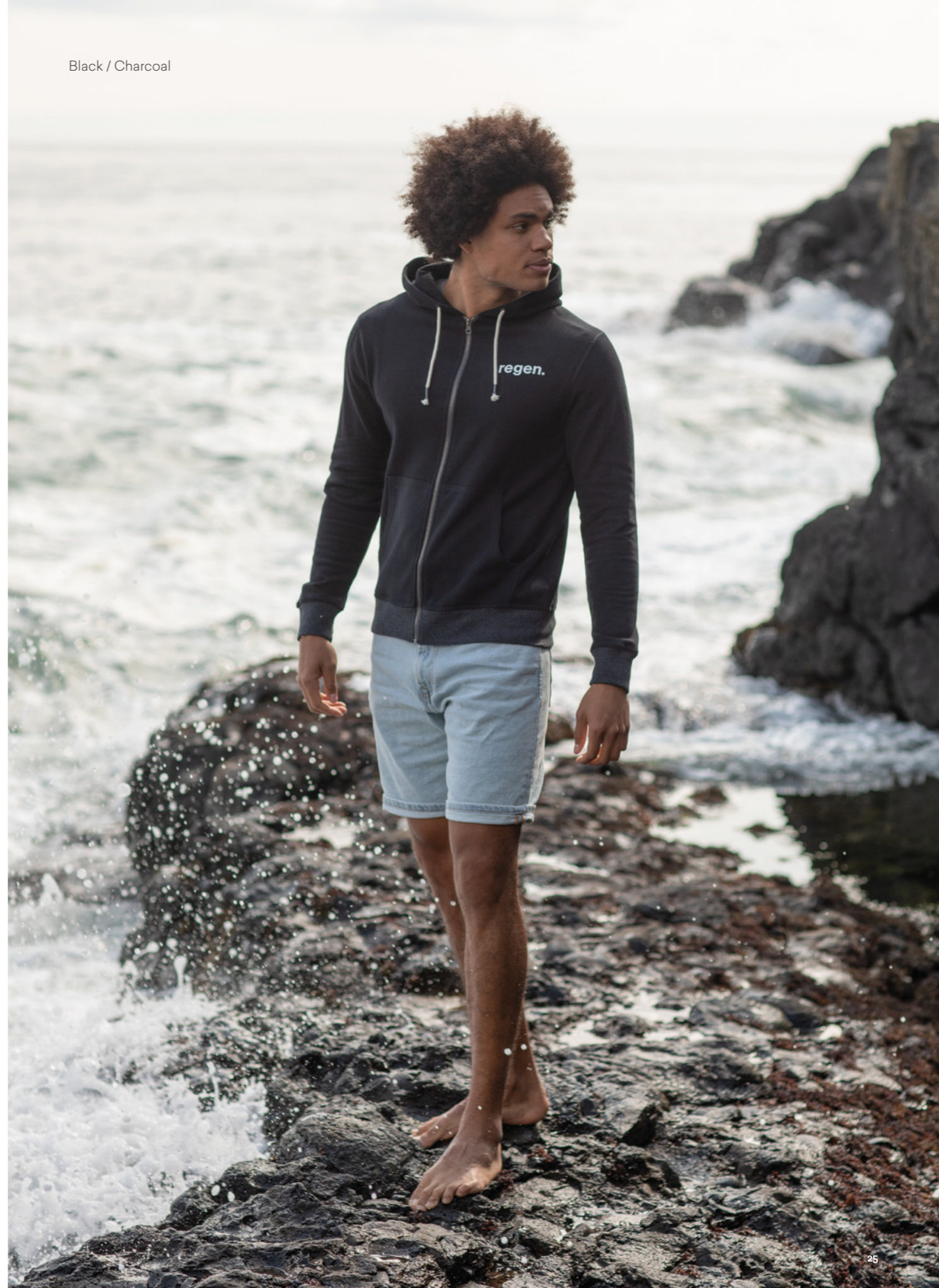
Black / Charcoal