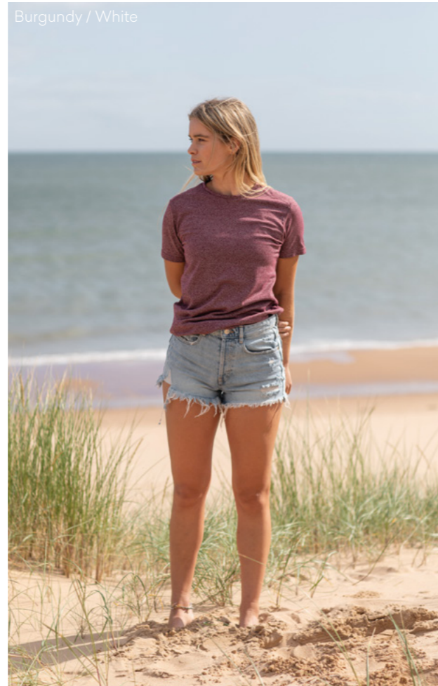
Burgundy / White